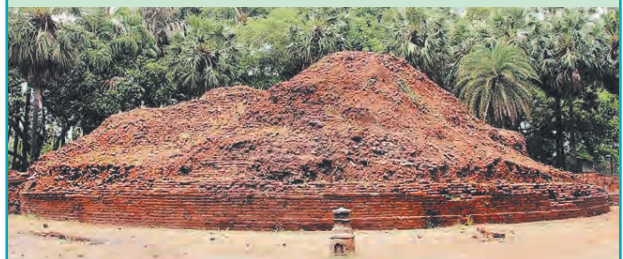
Stupa of Nalasopara