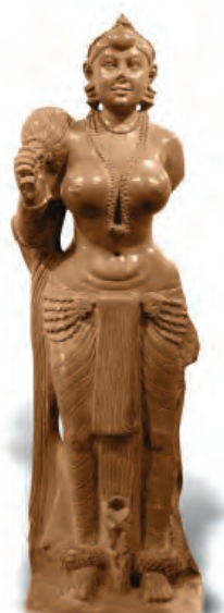
Chauri bearer of Didarganj

It appears that, during the Mauryan period, the artists had acquired the skill of cutting and carving the stone. In both, the skill of sculpting and the technique of mirror polish of the stone is seen. This is known as 'Mauryan Polish'. During this period stone statues of Yaksha and Yakshi are found.