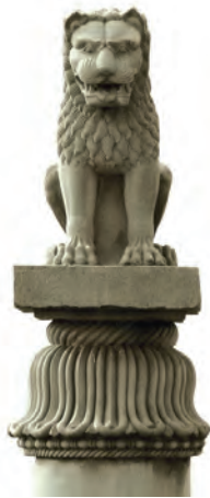
Capital of an Ashokan Pillar

There was a huge palace of Chandragupta at Pataliputra. Megasthenes compares it with the Palace of Susa, the capital of Iran. The high brick fortification wall was built for the protection of the palace and inside the palace there were many buildings. These buildings were built of stone. Wood was also used in the buildings. The Chinese traveller Fa-hien has described this palace. One of the unique contribution in the field of art are the huge standing pillars erected during the period of Ashoka for the spread of religion. We know them as Ashokan Pillars. These pillars are erected at thirty places. They are erected at places related to important events in the life of Gautama Buddha and on important royal paths. During Ashoka's period, stupas were built on a large scale. It is said that during his rule, Ashoka built 84,000 stupas.